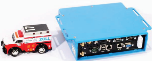
Orientation 7 ZOLL logo DOWN, connectors facing left.