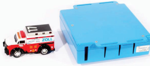
Orientation 6 ZOLL logo DOWN, connectors facing aft.