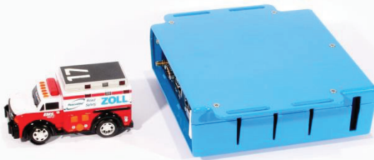
Orientation 5 ZOLL logo DOWN, connectors facing front.